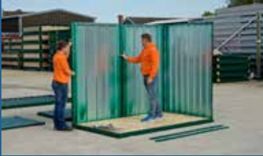
simple to assemble