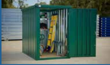
ready for use