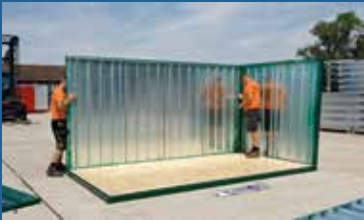
simple to assemble