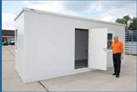
Expandacom - Flat-packed office/ accommodation unit