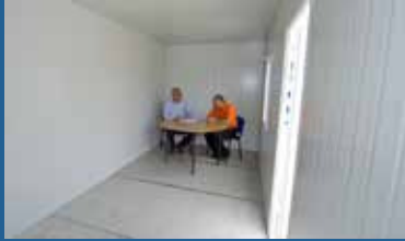
ready for use