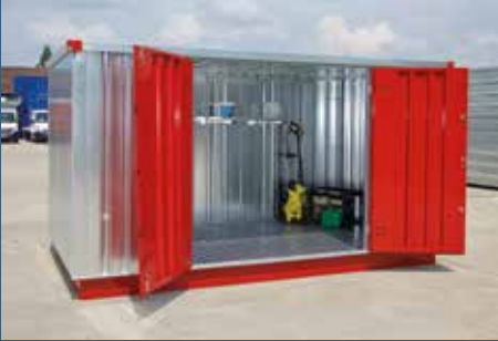
Expandachem - Flat-packed storage unit for the safe storage of chemicals and lubricants

Other great storage and accommodation solutions include: