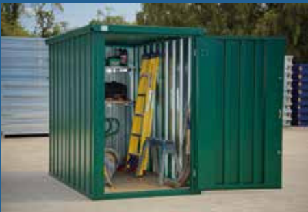
Gardenstore - Flat-packed secure storage unit for all your garden equipment