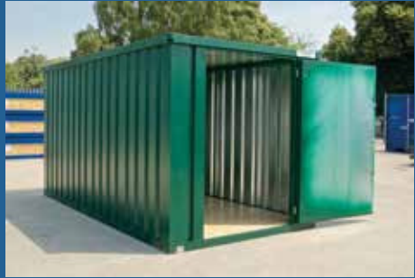
Expandastore - Flat-packed storage unit