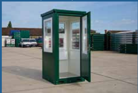
Expandakiosk - The UK's market leading insulated, man portable kiosk

The Expandarange of flat-packed buildings is available from: