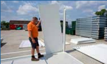
simple to assemble