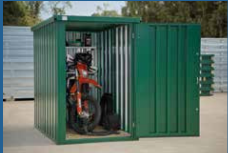
Bikestore - Flat-packed secure storage unit for cycles, motorcycles and tools