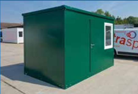
Expandakabin - Flat-packed office unit home and commercial use