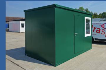
Expandakabin -Flat-packed office unit home and commercial use