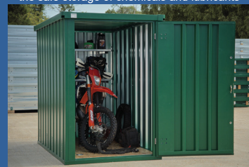
Bikestore -Flat-packed secure storage unit for cycles, motorcycles and tools