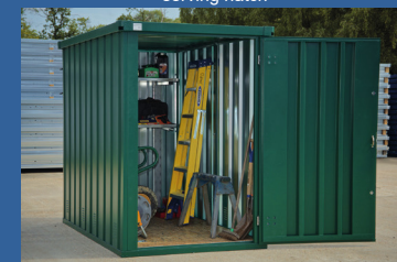
Gardenstore -Flat-packed secure storage unit for all your garden equipment

The Expandarange of flat-packed buildings is available from: