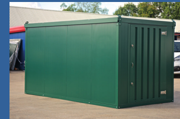
Insulated Store - Flat-packed storage unit