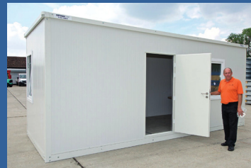
Expandacom -Flat-packed office/accommodation unit