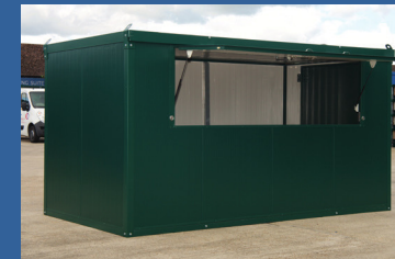
Expandakiosk -Flat-packed storage unit with serving hatch