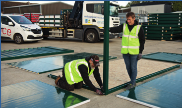
simple to assemble