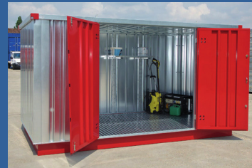
Expandachem -Flat-packed storage unit for the safe storage of chemicals and lubricants