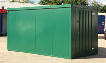
ready for use