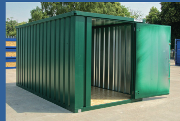
Expandastore -Flat-packed storage unit

Other great storage and accommodation solutions include: