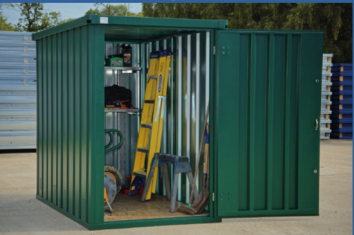
Gardenstore - Flat-packed secure storage unit for all your garden equipment

The Expandarange of flat-packed buildings is available from: