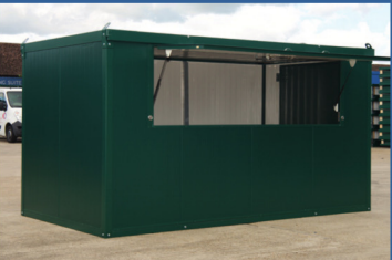
Expandakiosk - Flat-packed storage unit with serving hatch