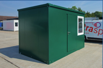
Expandakabin - Flat-packed office unit home and commercial use