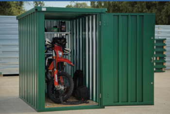
Bikestore - Flat-packed secure storage unit for cycles, motorcycles and tools