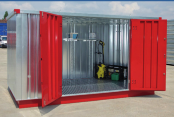
Expandachem - Flat-packed storage unit for the safe storage of chemicals and lubricants