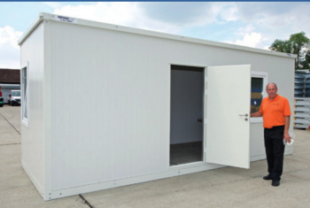
Expandacom - Flat-packed office/accommodation unit