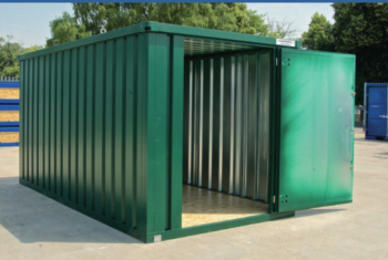
Expandastore - Flat-packed storage unit

Other great storage and accommodation solutions include: