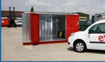
ready for use