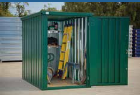
Gardenstore - Flat-packed secure storage unit for all your garden equipment