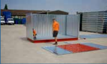
simple to assemble