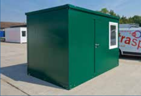
Expandakabin - Flat-packed office unit home and commercial use

Other great storage and accommodation solutions include: