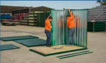
simple to assemble