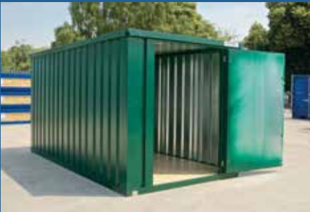
Expandastore - Flat-packed storage unit