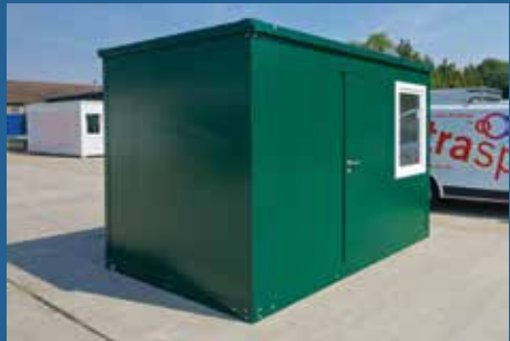
Expandakabin - Flat-packed office unit home and commercial use