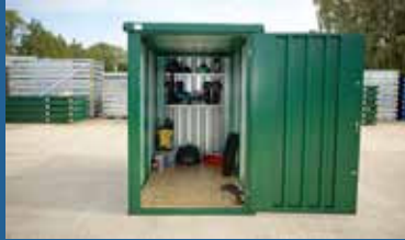
ready for use